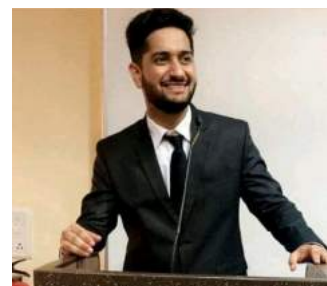
FROM THE EDITOR'S DESK

A Publication Of SIES College Of Arts, Science & Commerce (Autonomous) (For Private Circulation Only)